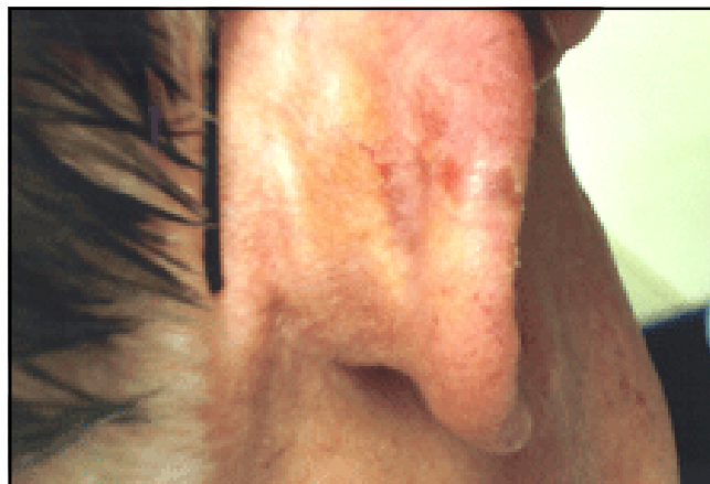
Fig 1 and 2: BCC on ear at start of treatment and the same area 4 weeks later after PDT